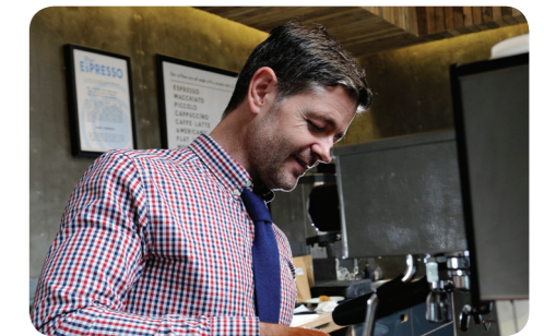
Most Environmentally Aware Business Laboratorio Espresso

Laboratorio Espresso is a small, artisan Italian inspired espresso bar in the city centre. Their traditional Italian blend coffee and northern Italian 'slow food' is served fast-paced and friendly.