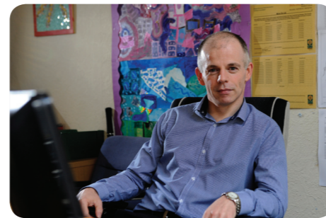
Social Impact Award FareShare Glasgow

FareShare Glasgow and West of Scotland is a unique service fighting hunger and its underlying causes by providing food to local charities and community organisations. Working in partnership with the food industry, FareShare distributed 122 tonnes of food in the last 18 months; the majority of this was surplus food and would otherwise have gone to waste.