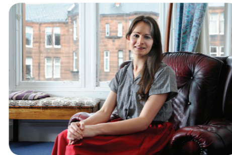
Best Use of Social Media Love Vintage Events

Jobs & Business Glasgow supports enterprise creation across Glasgow’s communities contributing to creating a sustainable business base in the city. These awards showcase the range and diversity of business start-ups we support.